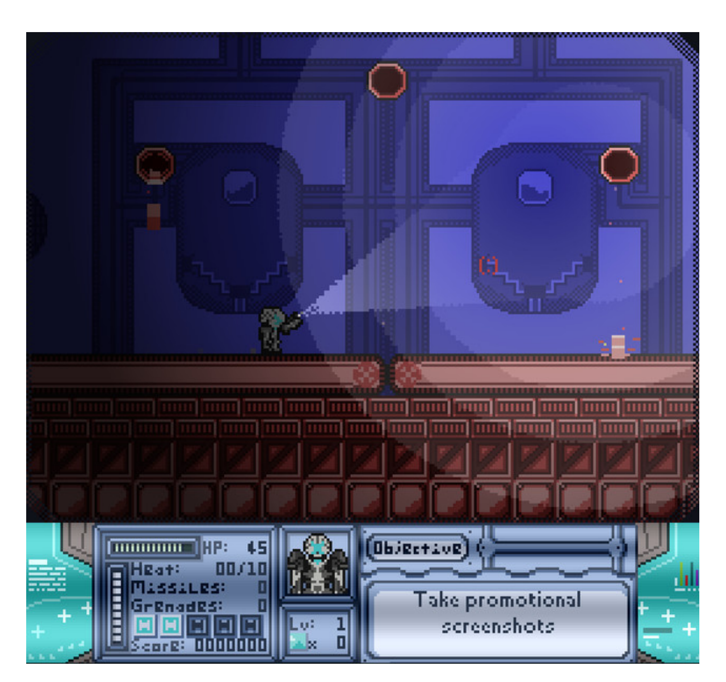
EnHanced Download For Pc [full Version]